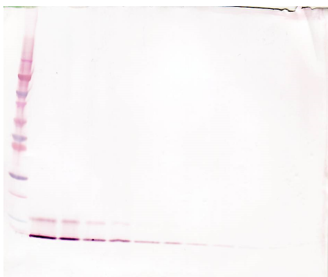
ARG56796 anti-MIP4 antibody (Biotin) WB image

Western blot: 250 - 0.24 ng of Human MIP-4 stained with ARG56796 anti-MIP4 antibody (Biotin), under reducing conditions.