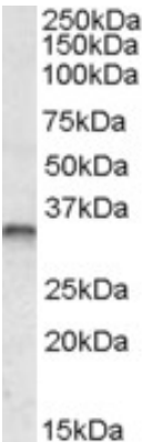
ARG64936 anti-JUNB antibody WB image

Western Blot: extracts from HT29 cells untreated or treated with EGF stained with anti-JunB (phospho Ser259) antibody ARG51531.